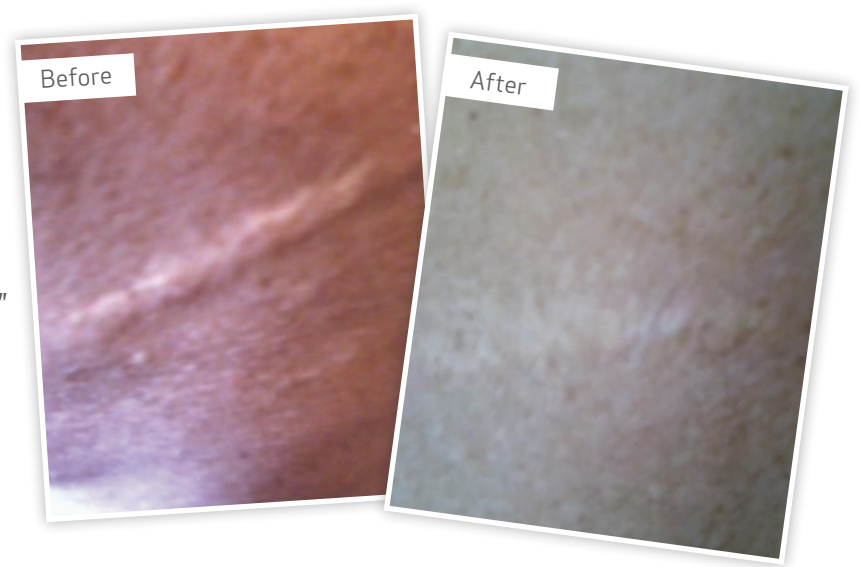
"Astonishing results! Thank you , RENU 28."